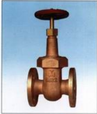
JIS. F7367 JIS. F7368

Marine Bronze Rising Stem Type GateValves JIS F7367 5K