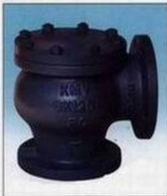
Marine Cast Iron Lift Check Globe Valves JIS F7358 5K