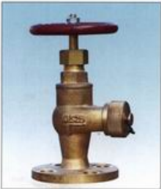
Marine Bronze Globe Hose Valves JIS F7334 5K/10K