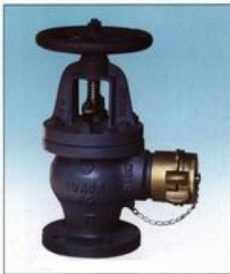
Marine Cast Iron Globe Hose Valves JIS F7333 5K