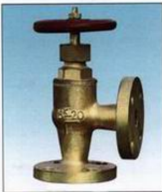
Marine Bronze Screw Down Check Globe Valves JIS F7409 16K