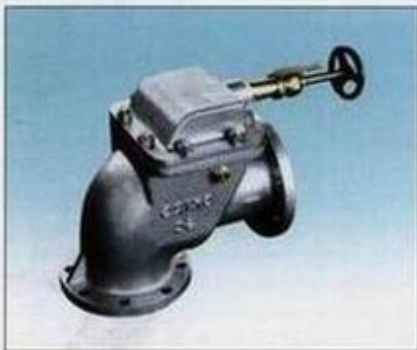
Cast Steel Down Storm Valves for Marine JIS F3060 5K